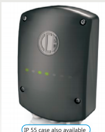
IP 55 case also available