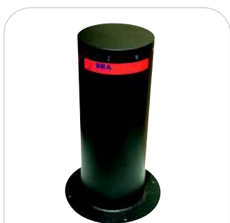
SUPER BULL: Heavy duty automatic bollard, with 12mm thick casing.