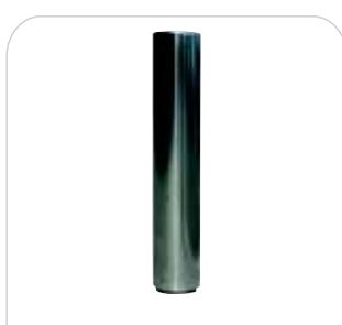
SOFT: New stainless steel fixed bollard for parking and public areas.